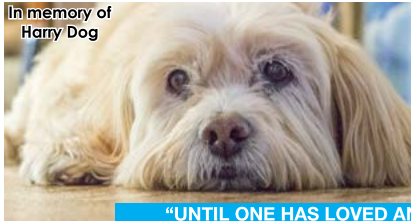
In memory of Harry Dog

If you are interested in learning more, checking out more artwork, or would like to find my contact information, please visit stuffryandoes.org